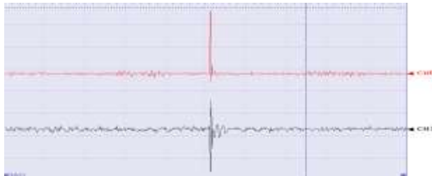
A typical impulse response of tibia of normal subject

From the results obtained, we can conclude that the acceleration value obtained in terms of mille volts in channel 2 (Y-Axis of second accelerometer) is found to be high in Case of the above 35 age group compared to the below 35 age group. In general, four channels of the DAQ card are used to acquire the X, Y axes reading from the MEMS accelerometer. The Channel 0, and Channel 1 acquires X, Y axis of first MEMS accelerometer and Channel 2 and Channel 3 acquires the X, Y axis reading of the second accelerometer.