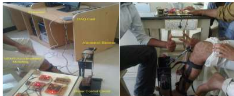
Camera view of the hardware setup